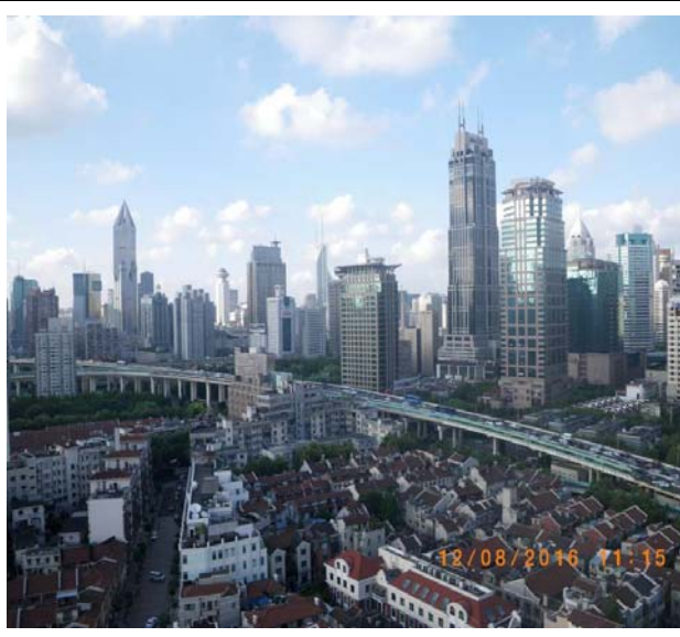
Shanghai, pogled iz ureda