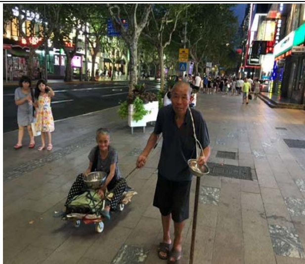
Ima i u Kini prosjaci