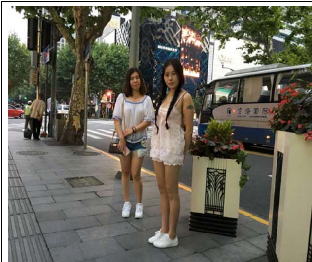
Mat i cer