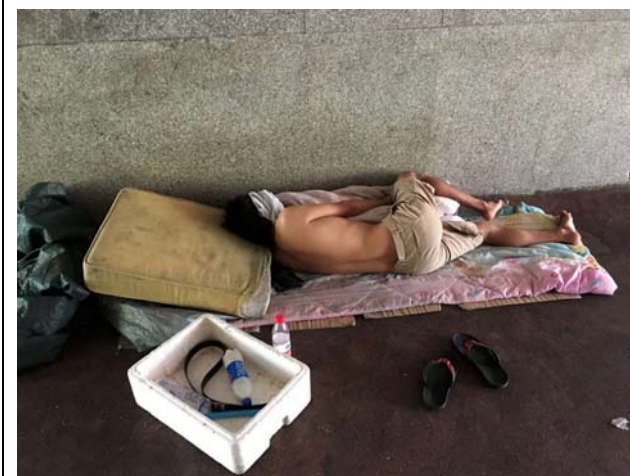
Ne mucu ga vile, ni bogastva svita