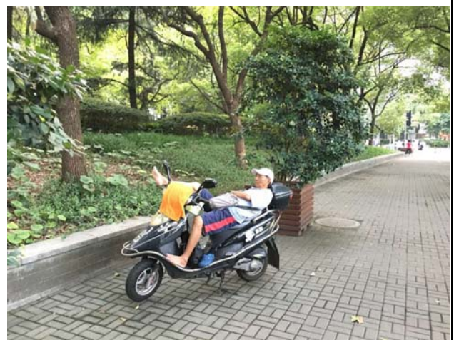
Udri brigu na veselje