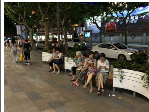
Stare Kinezice fumaju a mlaje gledaju mobitel