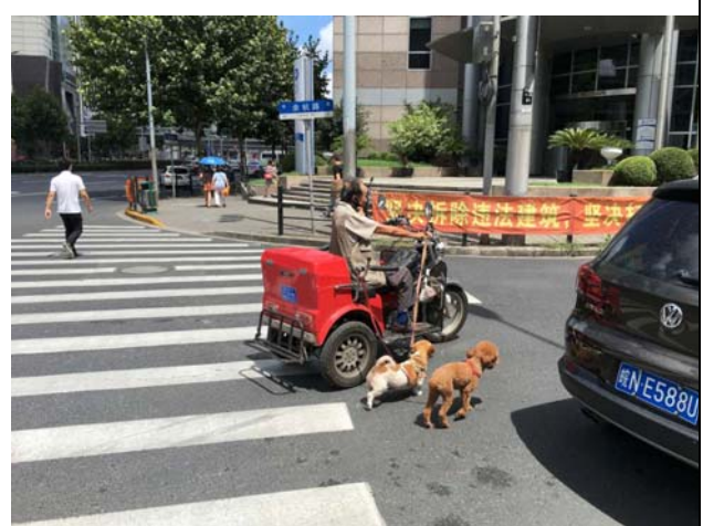
Dida Velko u stare dane